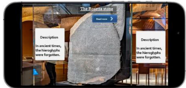
Figure 5. Design Concept – Home Screen

Below is a design I created, to avoid too much overlays obstructing the view of the actual museum object leading to a much better user experience when using the mobile application.