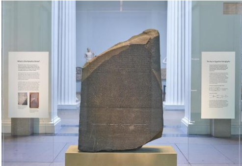
Figure 3. The Rosetta Stone at the British Museum.

For this concept, I would be using the Rosetta stone from the British Museum, an ancient Tombstone with classical Arabic writings from the British Museum, and an ancient Leave Model with Quranic inscriptions from the Victoria and Albert Museum.