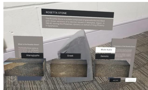
Figure 7. Prototype – Translation tab on the right-hand side, three sections of Rosetta Stone separated with options to Play and Mute recitation audio.

I made three models to demonstrate that the application of this design concept can be applied across various type of museum artefacts with inscriptions and writings.