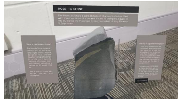
Figure 6. Prototype – A virtual model gets animated into view showing more details on the right-hand side with a button option to view translation

examine a 360-degree view of the model. The figure below shows the view that is displayed on click of the 'Read More' button.