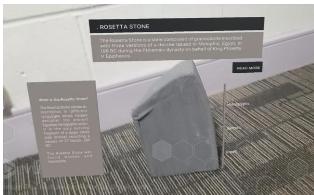
Figure 5. Prototype – A model of the Rosetta Stone with overlays to display more information about the model.

With Unity, I developed my application and 3D objects using my design structure as a guide.