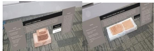
Figure 8. Prototype – Two other artefacts with foreign inscription using the same design concept.

I made three models to demonstrate that the application of this design concept can be applied across various type of museum artefacts with inscriptions and writings.