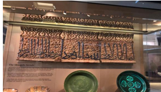
Figure 2. Islamic Writing Scribe at the Victoria and Albert Museum