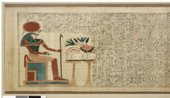
Figure 1. Egyptian Hieroglyphics at the British Museum.